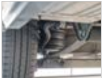
SEMI AIR SUSPENSION