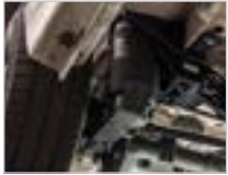
FULL AIR SUSPENSION

In addition to the products from the 'helper and reinforced springs' product group, we also offer a wide range of other products. Our products fall into one of four product groups. These product groups contain a variety of systems for many different makes and models, meaning that there is always a suitable solution for you.