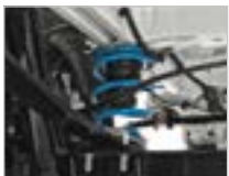
HELPER AND REINFORCED SPRINGS